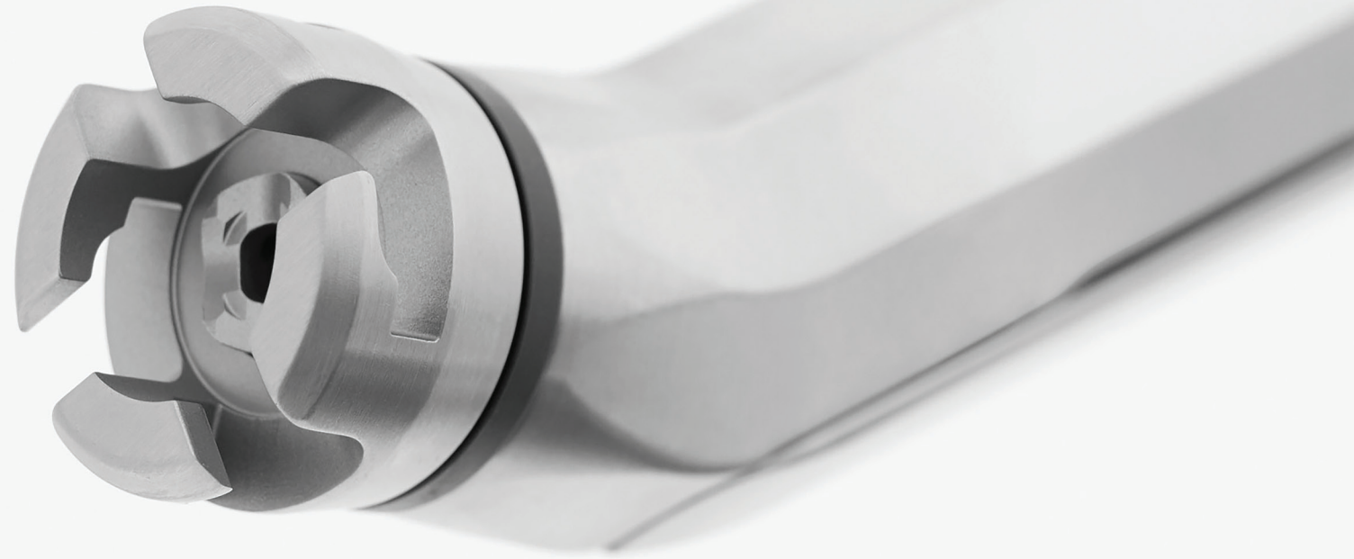
Offset Reamer Driver – Open