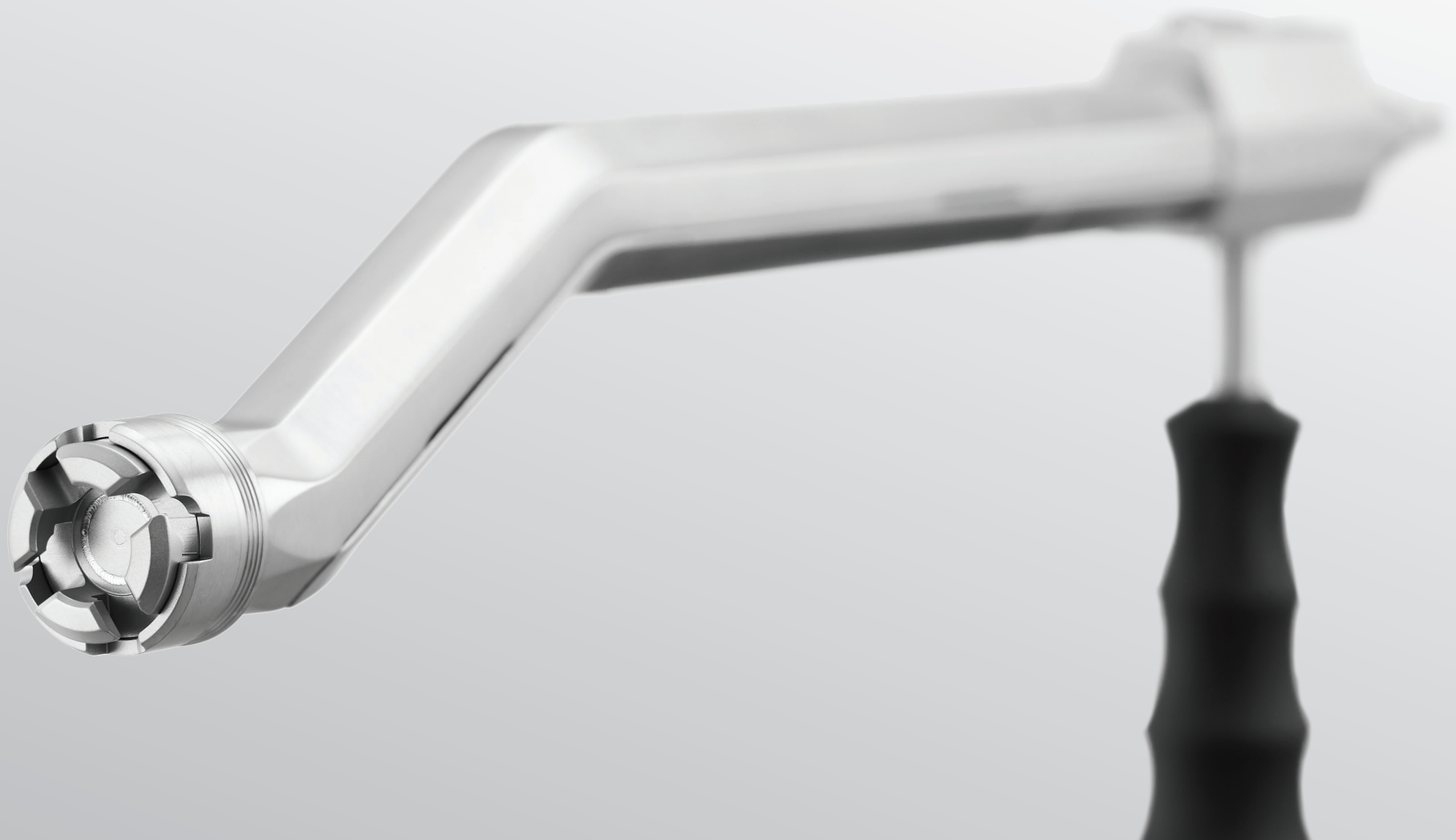
Offset Reamer Driver – Locking