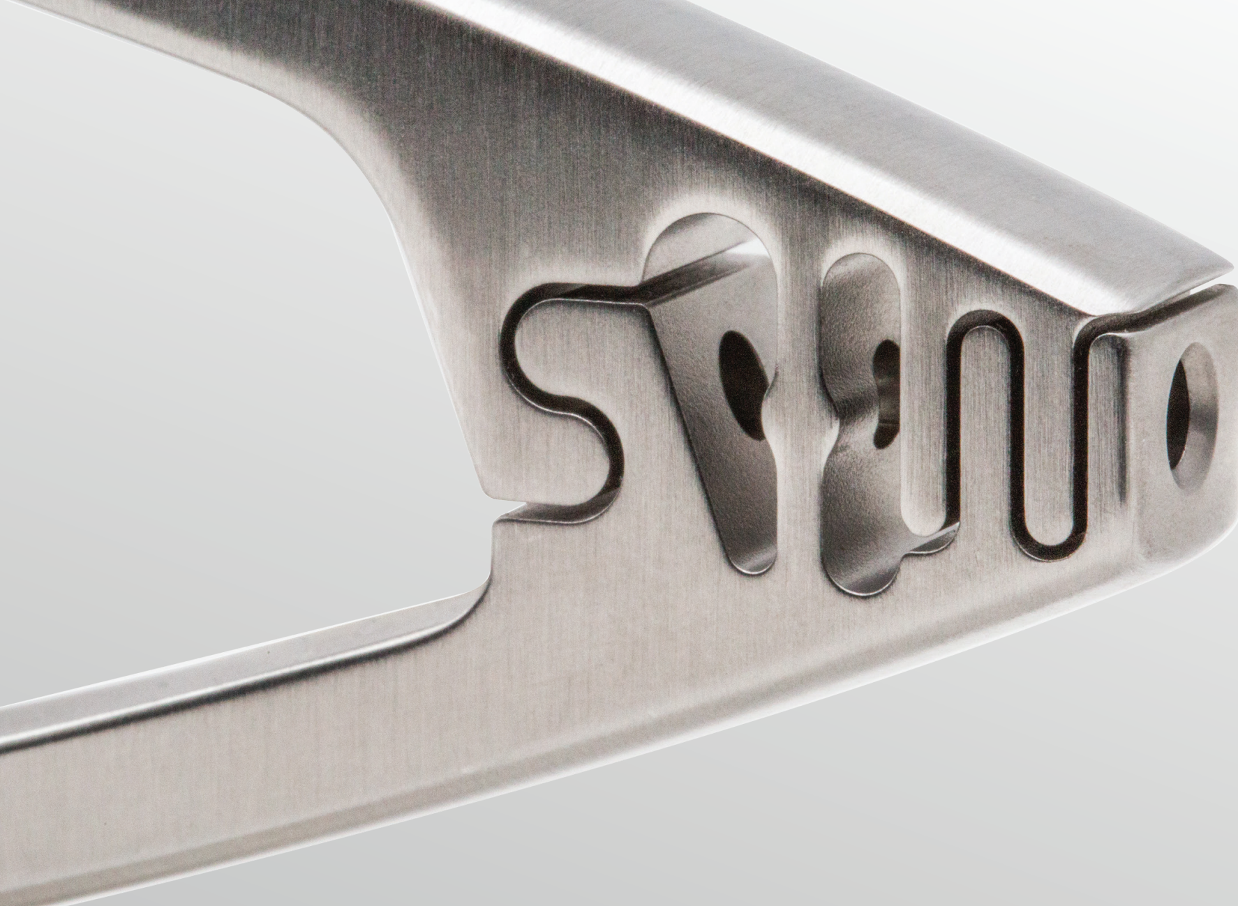
Classic Pin Puller