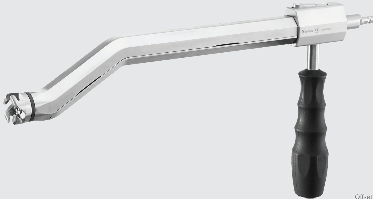
Offset Reamer Driver – Open shown